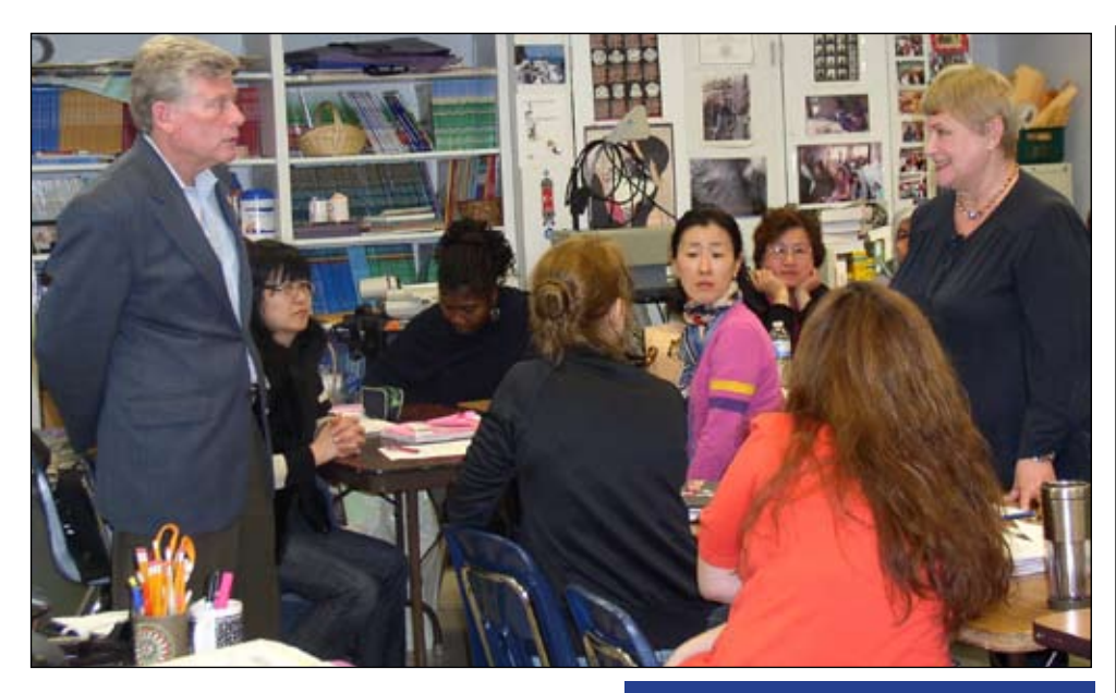
State Rep. Mark Ouimet answers questions of a middle-level English as a Second Language class at Stone High School. Students studied government before Ouimet's visit.

VIDEO: Visit to ESL class online at news.a2schools.org