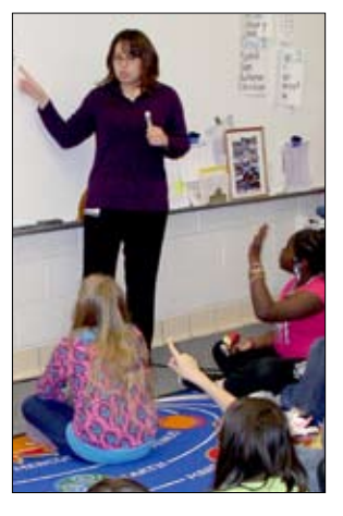
University of Michigan School of Education interns work with students at Mitchell Elementary School during the after-school Mitchell Mighty Mustangs program. U-M's involvement comes with a proposed partnership with the district that would involve both Mitchell and nearby Scarlett Middle School.

The Mitchell Mighty Mustangs program is funded with Title I grants and participating stu-