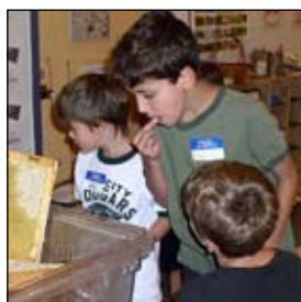
Campers take a taste of the sweetness as they help to harvest honey at Lakewood Elementary.