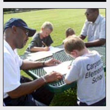
Carpenter parents work with students of all ages during the Carpenter playground event for ThinkStretch.