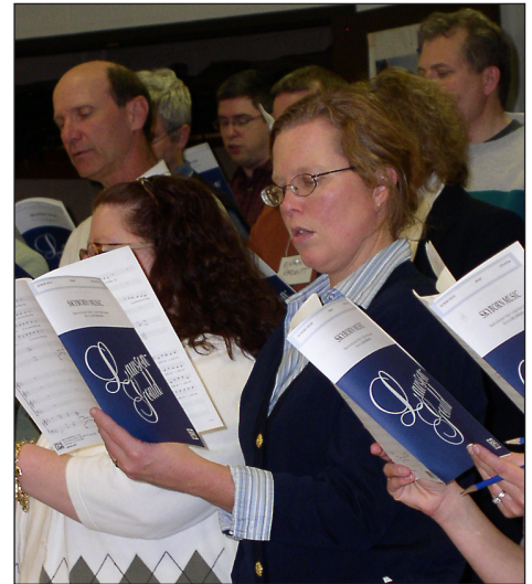
Members of the Ann Arbor Civic Chorus rehearse Monday nights at Slauson Middle School.